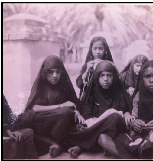
Figure 11 Girls in a sewing club- 1940.