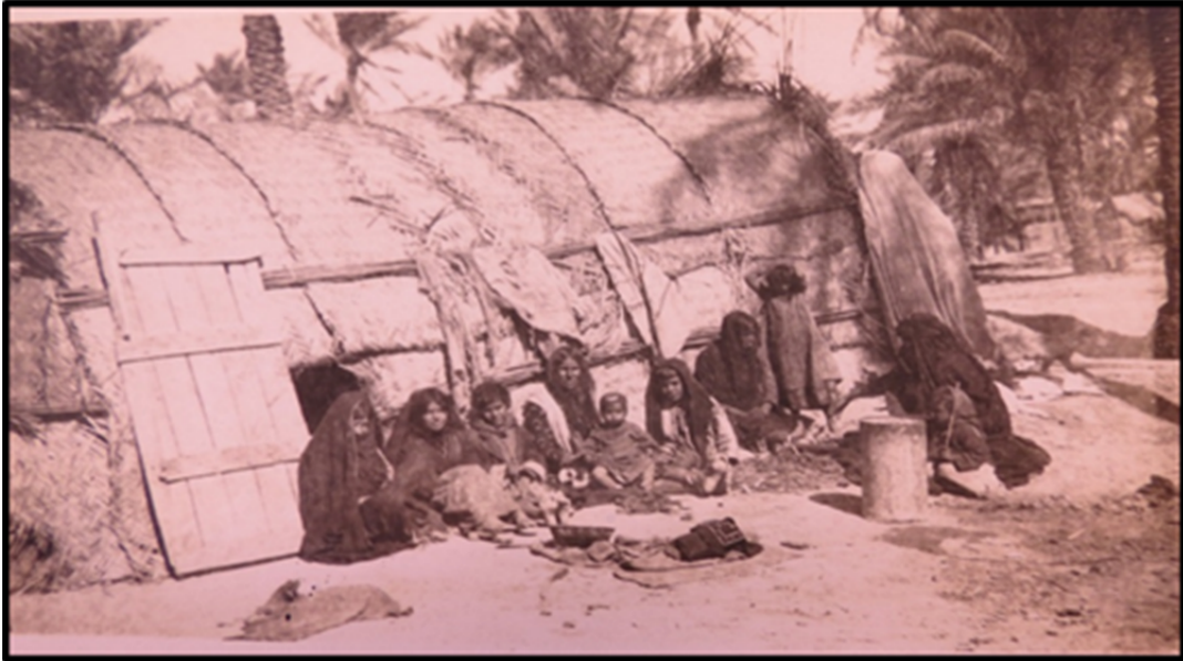
Figure 10 Students from the mud-hut settlement.

of the clubs who lost everything they owned to successive fires, and to those children who lived in these miserable circumstances.