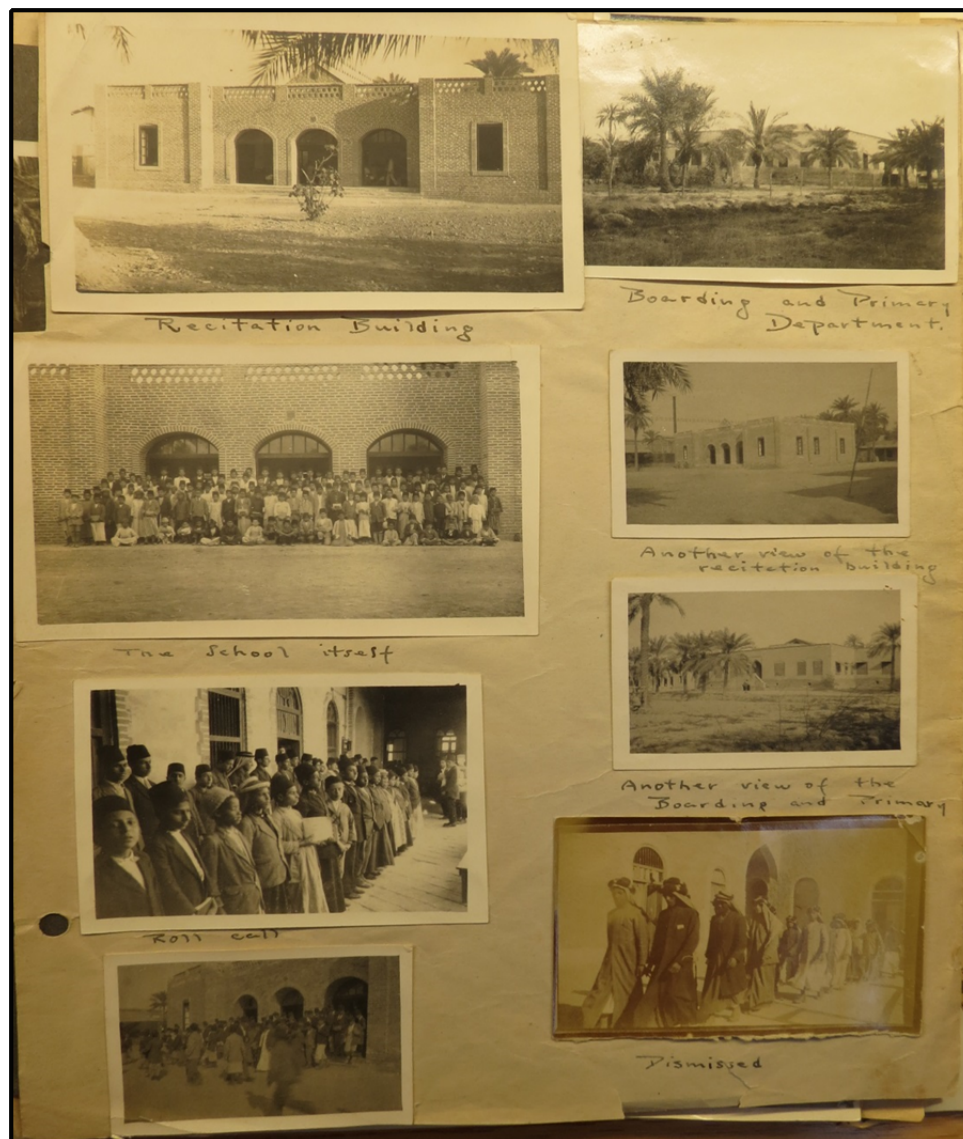
Figure 9 Different views of the school of High Hope, 1912-1914.

Both schools continued to grow either because of their founders' inclusive relations, or because of their outreach methods (Figure 9). However, the biggest stride happened after the British occupation of Basra in 1914.